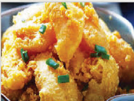
金沙咸蛋黃南瓜 $12.95 Salt Egg Yolk w. Pumpkin