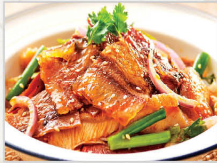
夫妻肺片 🌶️ $12.95 Beef Tripe in Chili Oil