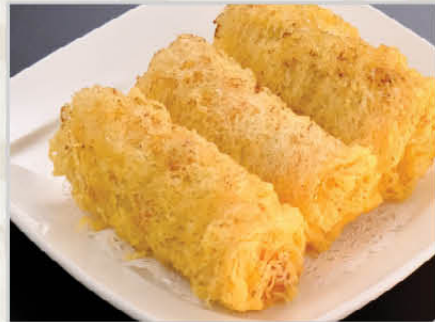
海皇卷 $6.95 Seafood Roll