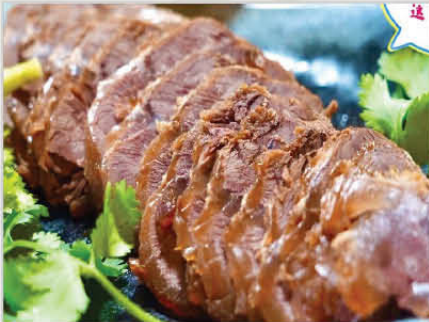
滷牛腱 $12.95 Braised Beef Tendon