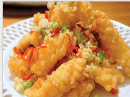
椒鹽鮮魷 $15.95 Salt & Pepper Squid