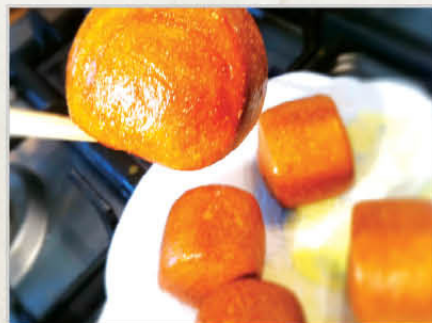
黃金饅頭 $6.95 Fried Mini Bun (6)