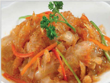
海蜇頭 $15.95 Jelly Fish Head