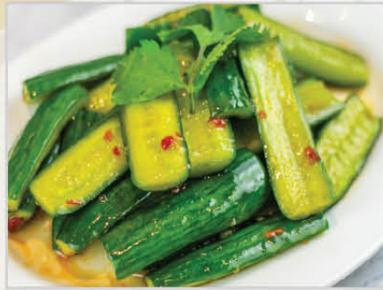
拍黃瓜 🌶️ $6.95 Cucumber w. Szechuan Spicy Sauce