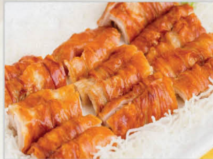
炸大腸 $15.95 Deep Fried Pork Intestine