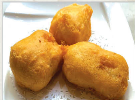
炸脆奶 $6.95 Crispy Milk Curd