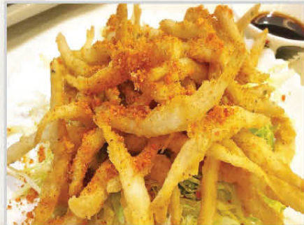
白飯魚 $15.95 Salt & Pepper Sliver Fish